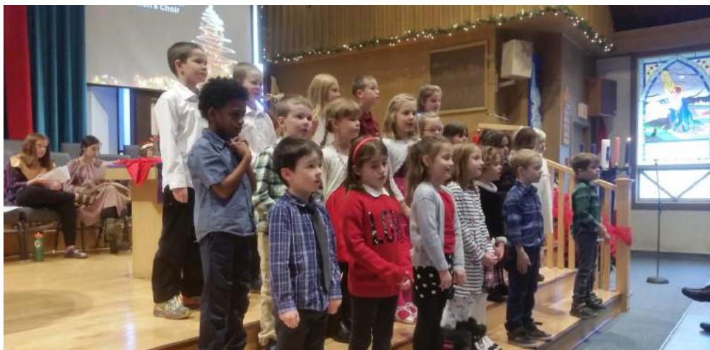
GUP Community Children's Choir participate in White Gift Service Sunday, December 3rd