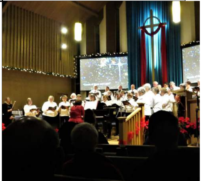
Christmas Cantata Sunday, December 10

Easter flowers will be purchased by the Worship committee to decorate the sanctuary at Easter but no flowers will be delivered to shut ins