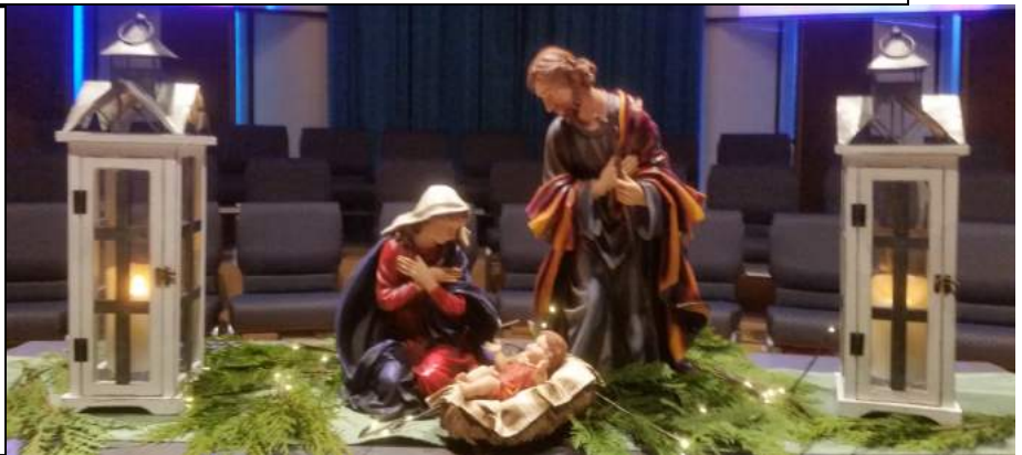
Christmas Creche Collection—November 18th Trinity's contribution to the GUM Doors Open Weekend

Deadline submission for the next Trinity Voices is Sunday, March 4. Email submissions to info@trinityunitedguelph.ca or leave a hard copy in the folder on the church office door.